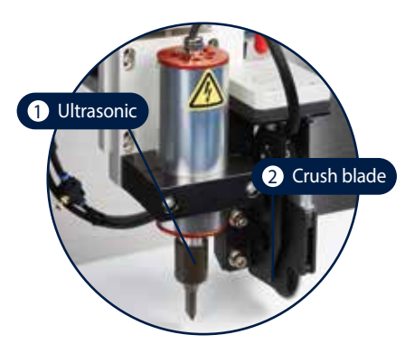
▲ Ultrasonic & Crush blade